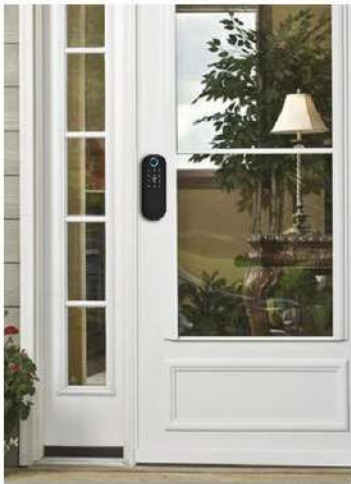
Glass Door with Frame