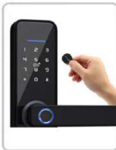
Smart Card Unlock