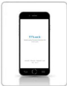
TT lock APP