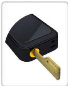
Metal Key Unlock