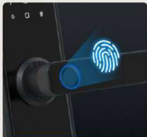
Unlocking via fingerprint