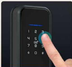
Unlocking via passcode