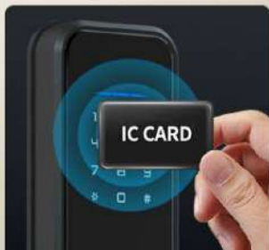
Unlocking via IC card