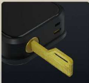
Unlocking via mechanical key